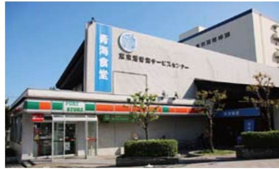
青海サービスセンター “Aomi service center”

Lodging, recreation and other welfare facilities are provided with the aim of creating a pleasant workplace and living environment.