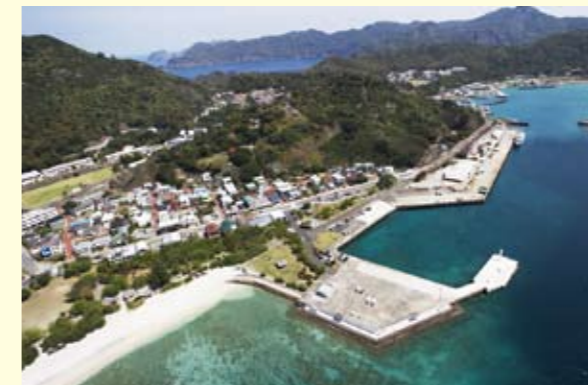
二見港 Port of Futami

The Ogasawara Islands were registered as the world natural heritage in June 2011.