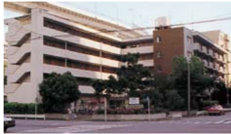
第三宿泊所 (むつみ荘) The third lodging “Mutsumiso”