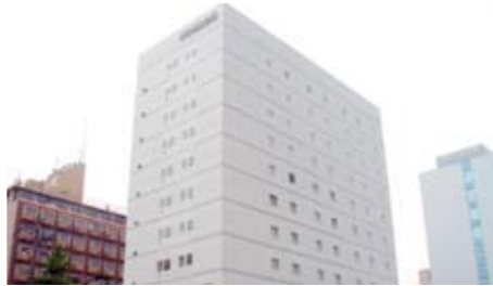
東京海員会館 “Tokyo kaiin kaikan”