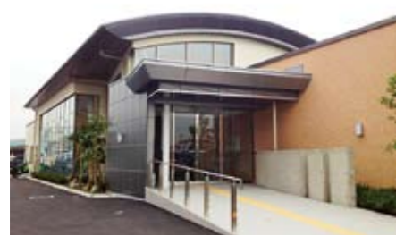
品川休憩所 “Shinagawa Resthouse”